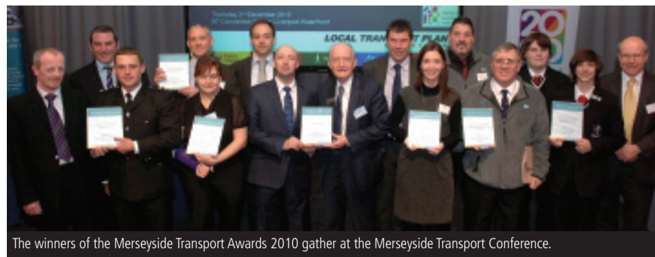
The winners of the Merseyside Transport Awards 2010 gather at the Merseyside Transport Conference.

For more information and to see presentations from the conference, visit www.transportmerseyside.org .